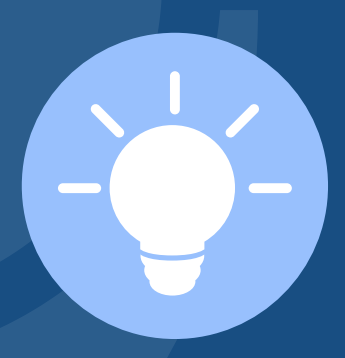
Did you know? Our fluteboard is available in both White and Black*

Our fluteboard is easily cut with a knife to shape and fit those tough areas